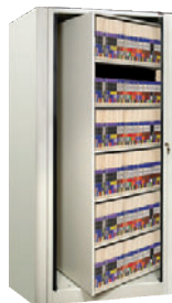
Ez2 ® Rotary Action File