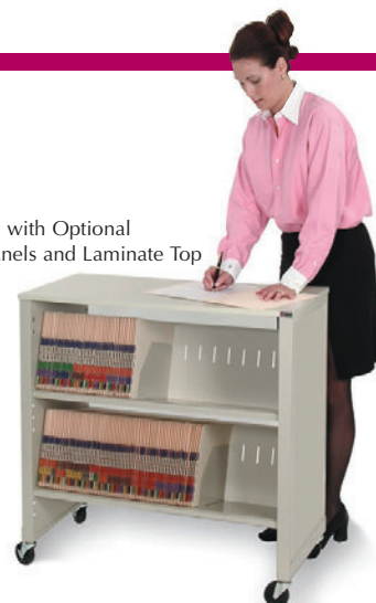
Shown with Optional End Panels and Laminate Top