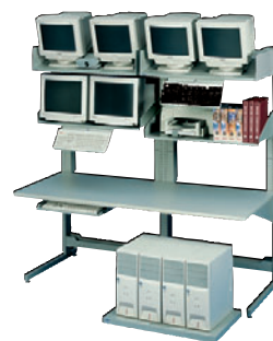
Technical Furniture Systems ™