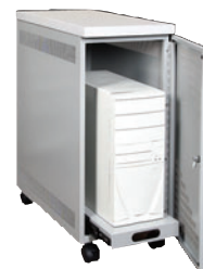
CPU Locker ™