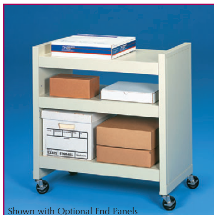
Shown with Optional End Panels